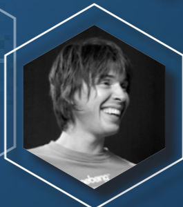
BRIAN COX OBE, FRS, Royal Society Professor for Public Engagement in Science, Professor of Particle Physics at University of Manchester.