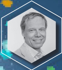
CHRISTER FUGLESANG, Astronaut and professor at KTH Royal Institute of Technology, Director of KTH Space Center